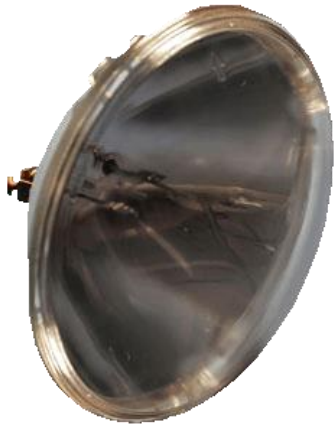
Locomotive Headlight Bulb PAR56